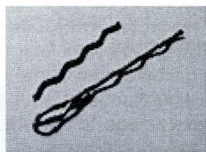
Fig. 2. Used fibers

In the course was made 6 fiberconcrete prisms using the fiber off-center center of gravity and 6 prisms with symmetric fibers see fig.2 (the prism of dimensions 100×100×300 mm). Test sample preparation meets Riga Technical University Latvian invention patent No. 14540. [2] After hardening, the model was the three-point flexural loading to failure loads within their carrying capacity macro crack stage. Analysis of experimental data, it was concluded that the viscous fluid flow more easily controlling the fiber off-center center of gravity, motion parameters (displacement, angle) varies more smoothly than the symmetric fibers. Fiber concrete specimens with off-center center of gravity of fibers showed a higher strength than the models with symmetric fibers.