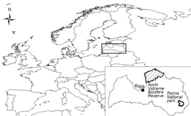
Fig. 1. Location of North Vidzeme Biosphere Reserve and Razna National Park.

The sampling territories are located in the North and Southeast of Latvia. They form particularly protected nature territories with a different status i.e., the North Vidzeme (region) Biosphere Reserve (founded in 1997) and the Razna (lake) National Park (founded in 2007), and they cover an area of 4576 sq.km and 596 sq.km respectively (Figure 1). Sampling territories were chosen in accordance with the principle that for these territories the LEP was duly elaborated. In these territories diverse types of landscapes could be found, for example, landscapes of agricultural lands, landscapes of large forest tracts, wetlands, lake districts and mosaic pattern landscapes that have been gradually developed through the interaction between humans and nature. The landscape structure and its resolution are the main distinctions characterizing these territories.