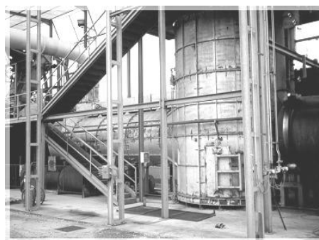
Figure 2. Slow pyrolysis waste processing plant. Pyrolysis reactor (kiln).

district heating systems or for industrial application (further gasification). In the following figure (Fig. 2.), an overview of pyrolysis reactor is shown (length 16 m, diameter 0.8 m, production capacity 0.5-1.5 t/h).