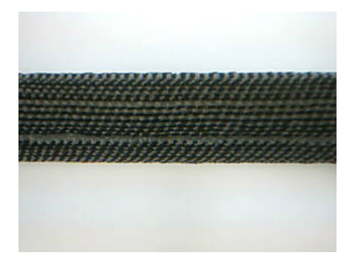
Fig.2. Prototype of innovative woven vascular implant

During this practical research several samples of aortic implants were manufactured using the technology of weaving (2/2 twill weave). Polyester, polyurethane and natural surgical silk were used in the process of weaving. (See Figure 2)